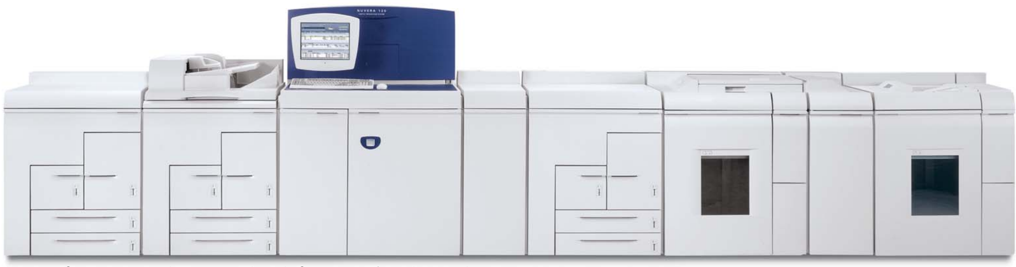
Xerox Nuvera® 100/120/144 EA Production System with FreeFlow® Print Server Professional, Integrated Scanner, Enhanced Line Screens, Post Insertion, In-line Stacking and Stapling